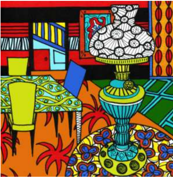
The Lamp Room