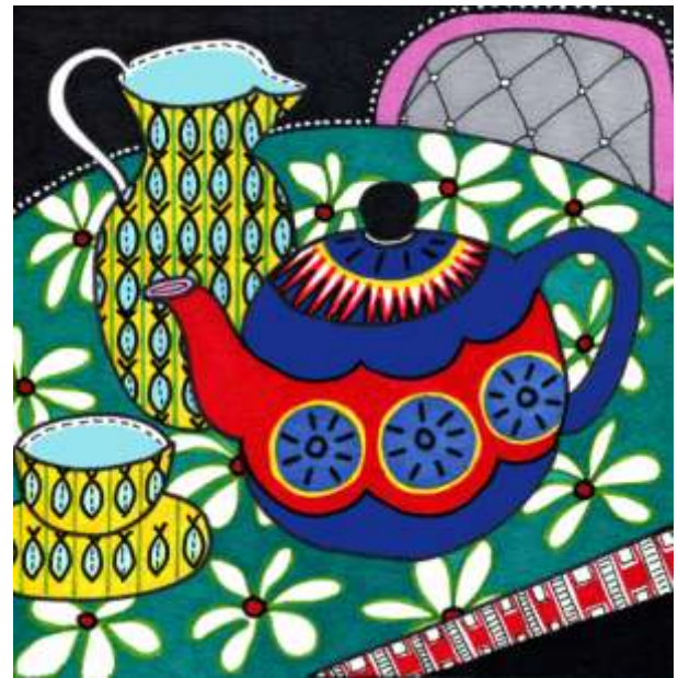
Floral Cloth & Teapot