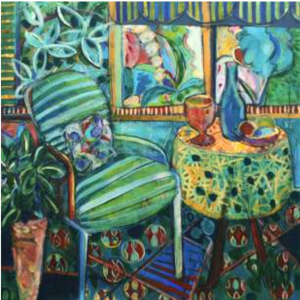
Wine on a Summer Evening