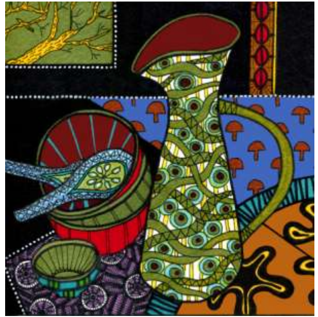
Pattern Jug & Bowls