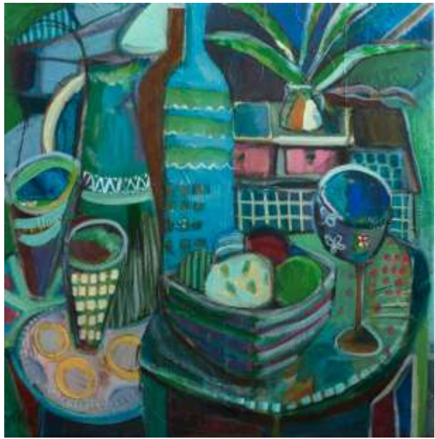
Lunch at the Villa