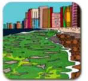
Walk on Beach