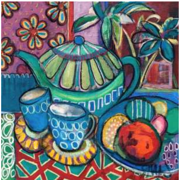
The Tea House