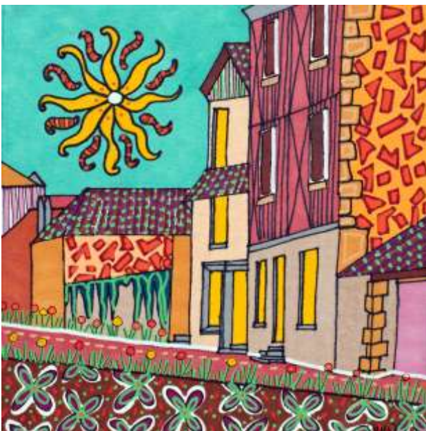
Summer in France