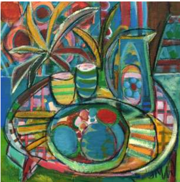
The Flower Jug