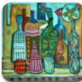
Bottles at the Window