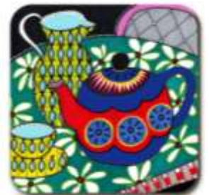
Floral Cloth & Teapot