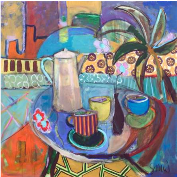
Coffee on the Terrace