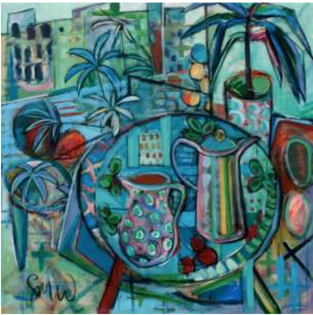
The Balcony View