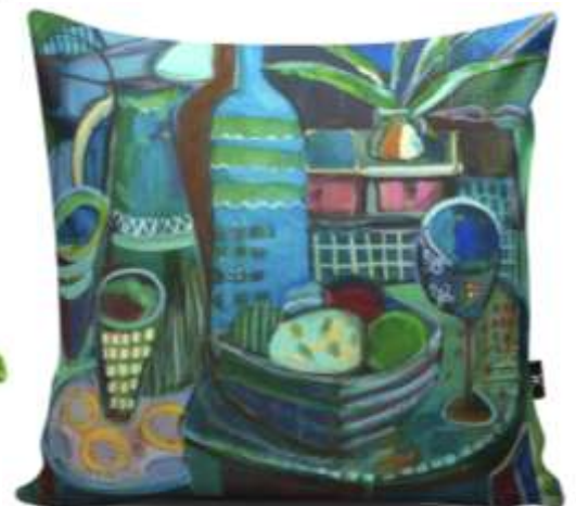
Lunch at the Villa