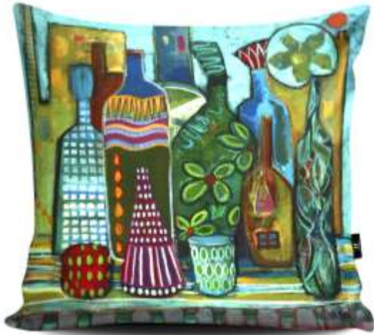
Bottles at the Window