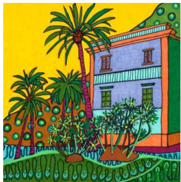
Palm Tree Villa