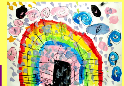
Collaborative collages compiled from pieces from all the year groups