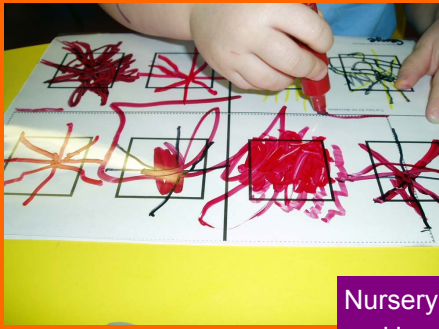
Nursery children's work: creating patterns on acetate and layering with their own under-painting.