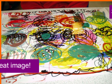
Selection of Year 2 work