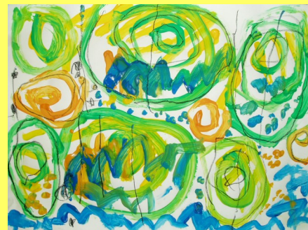
Year 1 & 2: scaling up elements of their own patterns to create large paintings